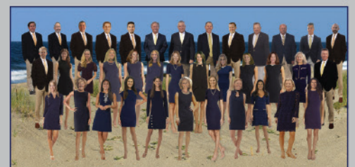
The Coastal Team